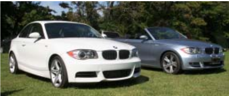
One plus One = Sweet rides