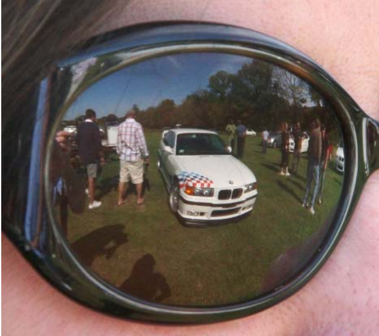
M3 Lightweight at the Picnic