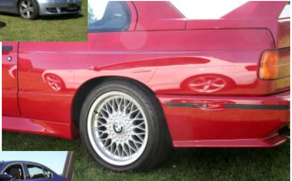
Hot and beautiful E30 M3 with Hotter 135i.