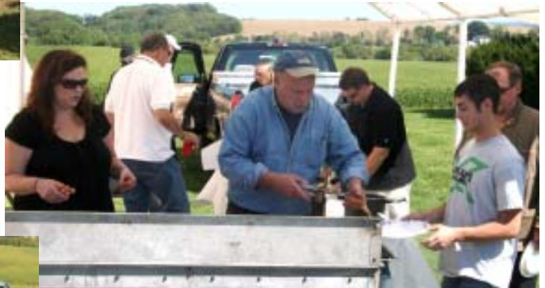
Good eats. and drinks.