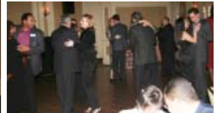
Dancing into the night...