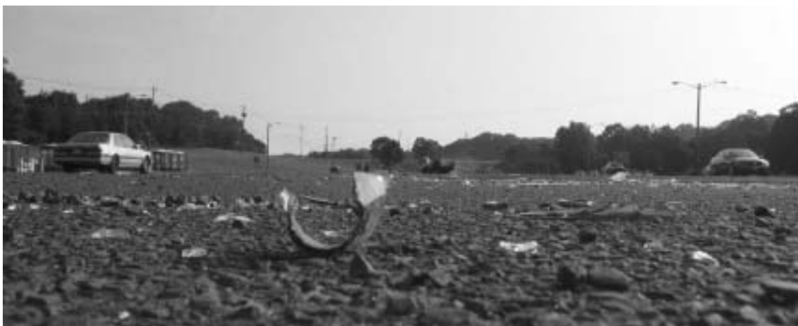
Extra Grip Surface