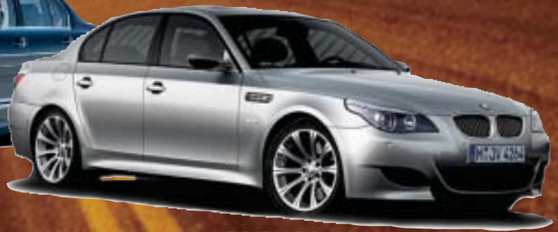
2006 BMW M5