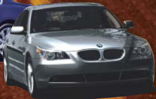
2006 BMW 525

Open Road BMW | 731 Route 1, Edison, NJ 877-322-0200