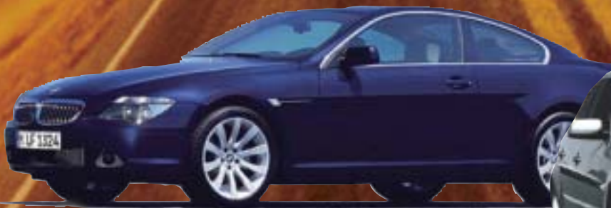
2006 BMW 650