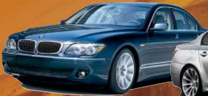
2006 BMW 750

OPEN ROAD BMW THE #1 VOLUME BMW DEALERSHIP IN NEW JERSEY.