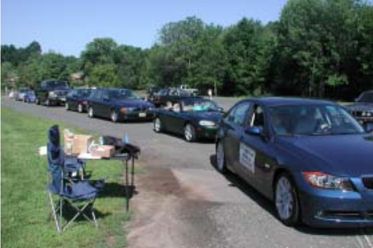
Rallyists Line up.