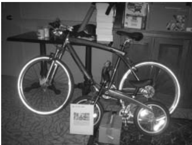
Great prizes from banquet sponsors.