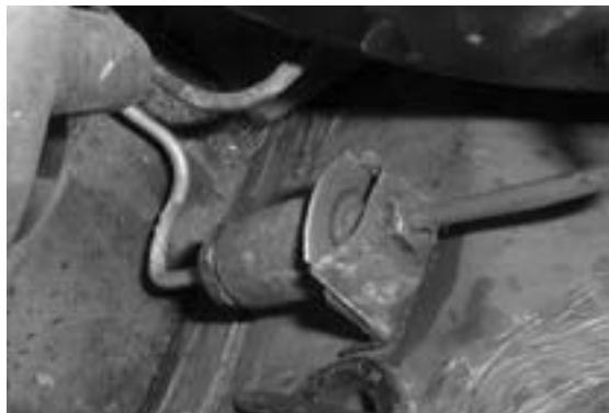
Photo #3 New Proportioning Valve

Photo #2 depicts the new tubing as it was being formed to match the failed line. The new tubing is shown connected to the removed proportioning valve. A lot of patience is required to bend the new tubing. I always buy a second piece of tubing to have on hand...just in case. Photo #3 shows the new tubing and the re-installed proportioning valve, while #4 is of the new tubing as it bends around the driver footwell in the area where the old tubing had failed.