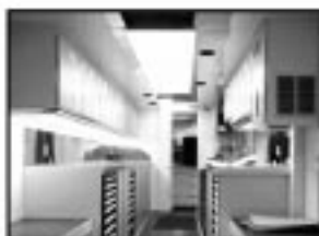
Our professional four car transporter features a fully-equipped shop and driver's lounge.

Trans Sport offers fully customizable solutions for our racing and transport customers including: