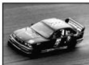
The Trans Sport BMW M3 in the Grand Am Cup race at the Rolex 24 Hours of Daytona™.