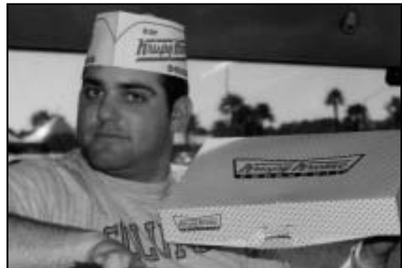
NJ Chapter members want to know: should we just keep running this photo every issue? So far, the polls say: YES!

By the way, I am now the happy owner of a 2000 Triumph Trophy 1200 motorcycle. I like it better than the 1997 BMW R1100RT I drove. In fact, I like my 1978 BMW R100/7 better than the R1100RT. Now that might get some response!